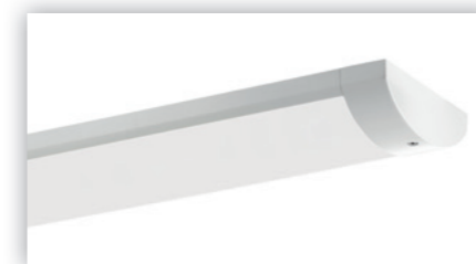
Homogeneous light distribution